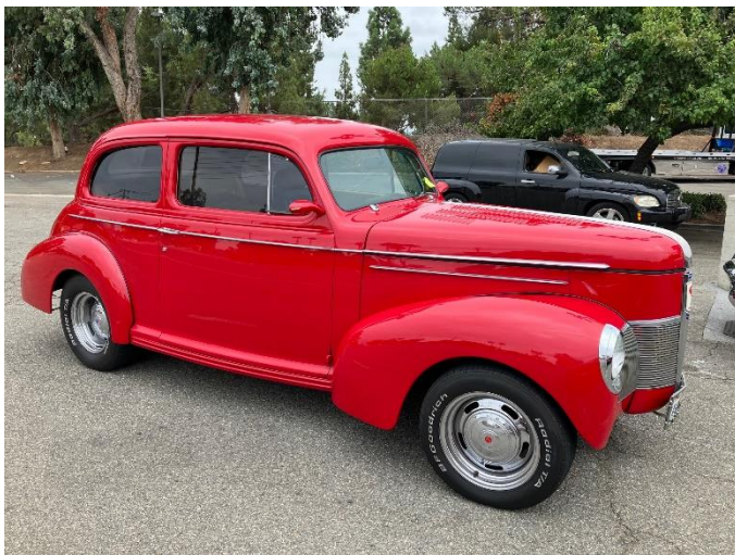
Gary Gross 39 Stude Manger's Choice Winner