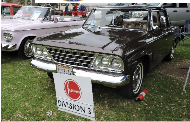
La Palma ~ 2024