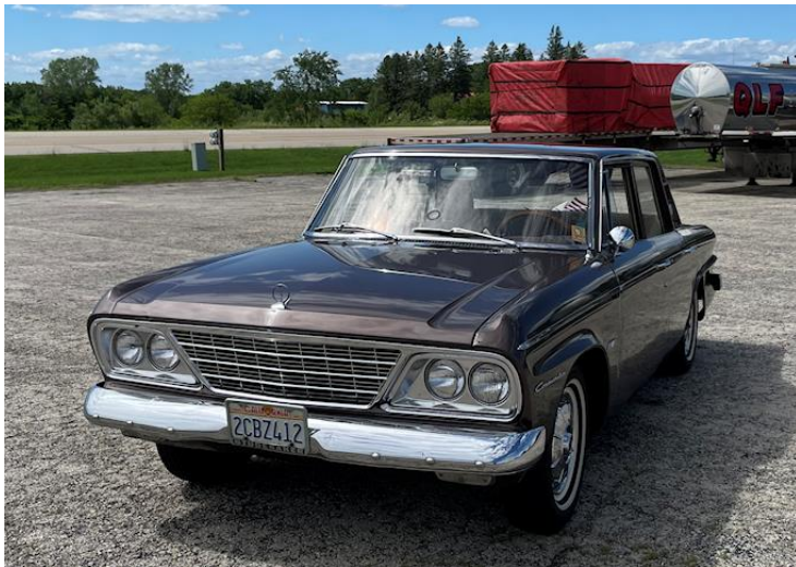
Highway 23, Dodgeville, WI ~ 2024