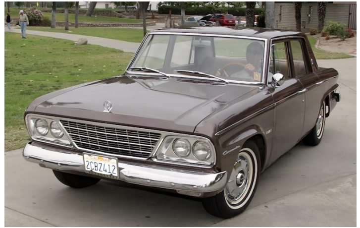
La Palma ~ 2009