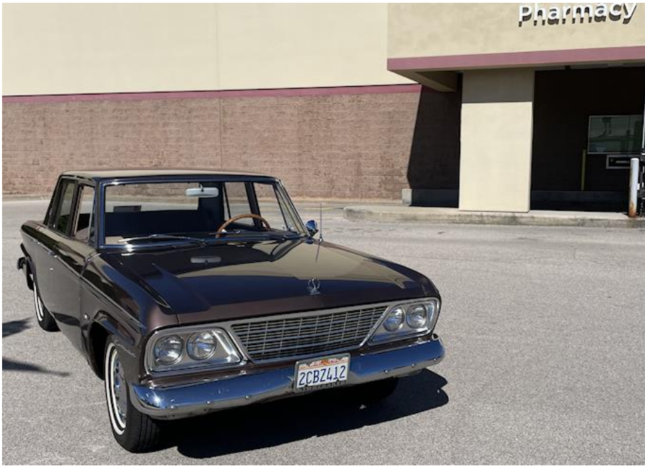
Left: The Commander parked at what was Henkel Motors, 2024.