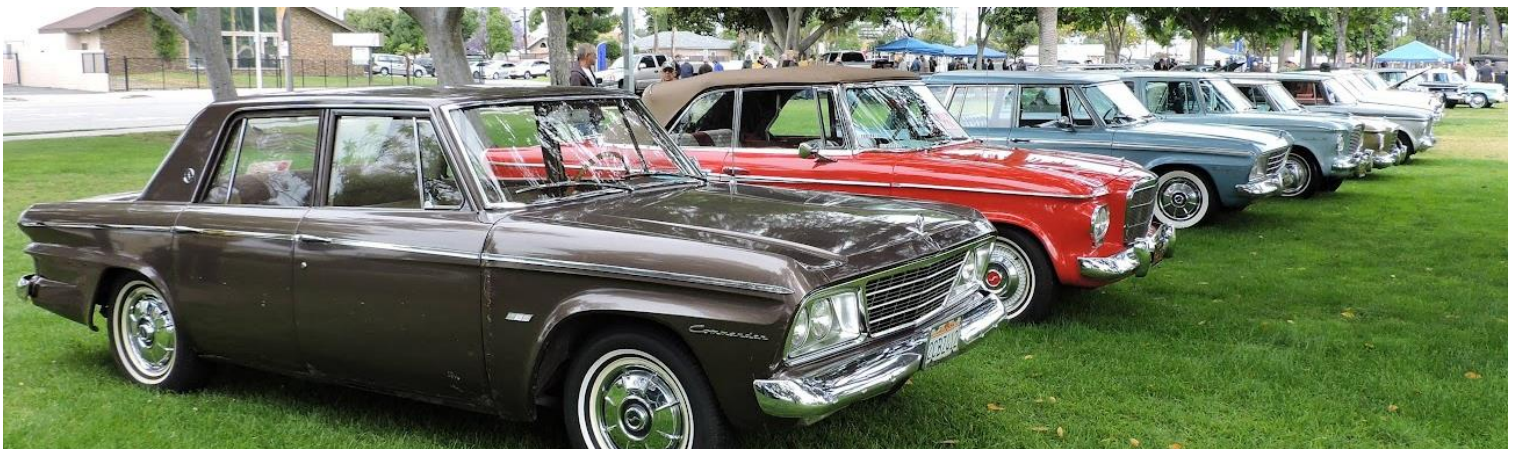
La Palma ~ 2021