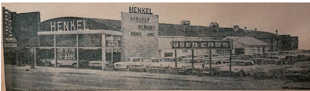
Left: Henkel Motors, Fond du Lac, Wisconsin, 1960