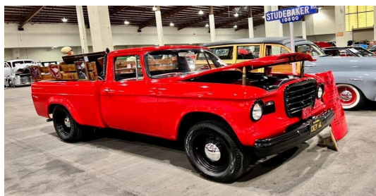
1964 Studebaker Champ Truck

Chevy 350, Turbo 400 transmission, 1970's Chev Camaro posi rearend. Disc brakes on all 4 wheels. 16" tires on front and 17", 10" wide tires on rear. Fuel cell under the bed. The fuel and brake lines are all hard lined. . Grant steering wheel (wood) and a Lokar shifter. Lowered almost 4 inches in the rear. New headers and new straight pipes with Smithy Glass packs.