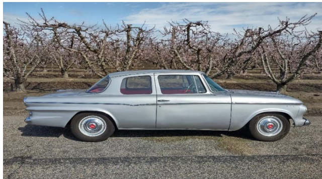
1962 Studebaker Lark Regal

1962 Studebaker Lark - Two doors, 350 Chevy crate engine and 700R4 automatic transmission. New interior with original exterior paint. The car is a very nice driver. New tires, new brakes