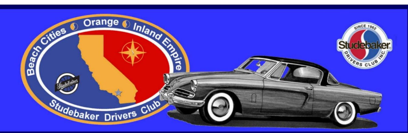
~ January 2023 ~