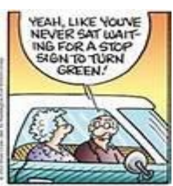
O Snan Crares