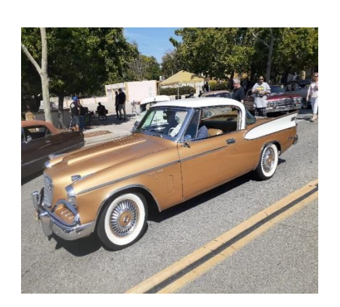
"57" Studebaker Hawk