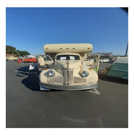
Studebaker Truck conversion into a camper