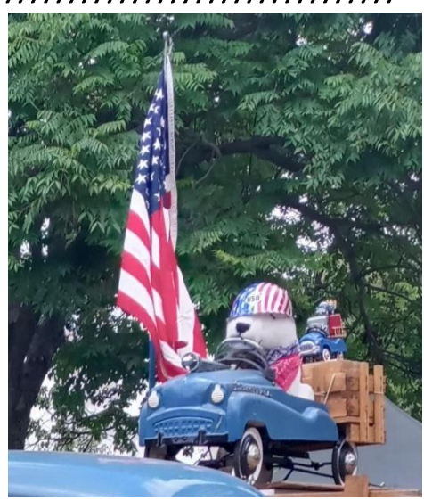
La Palma 48<sup>th</sup> Show May 29, 2022