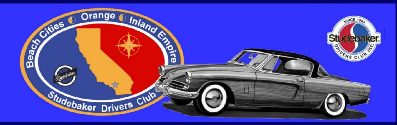
~ November 2022 ~